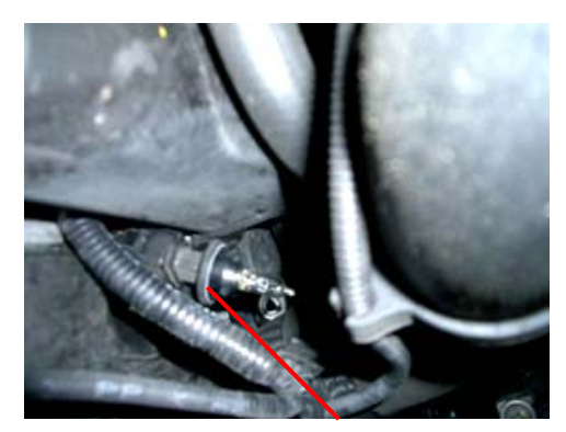
Indicator socket Fig. 2