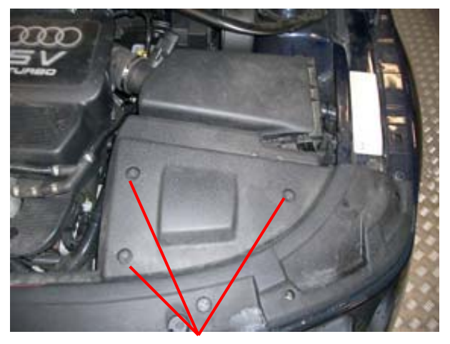
3 screws Fig. 3

To do this, loosen the two screws (a), the suction pipe (b), the plug on the mass air flow meter (c) and the plastic hose (d) and lift out the air filter box completely (Fig. 6).