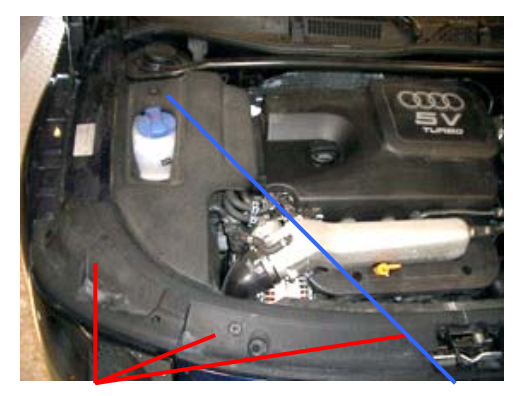
Clip (a) Screw (b) Fig. 1