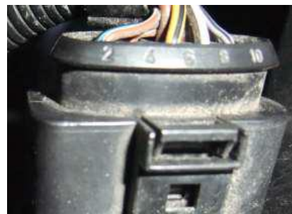
Figure 2.: 10-pin connector