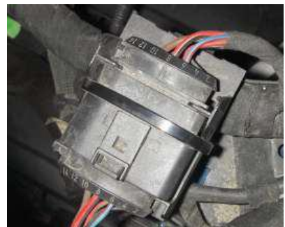
Figure 1.: 14-pin connector

You must handle it properly even in confined spaces. This prevents the plug connection from being damaged and working loose during further operation.