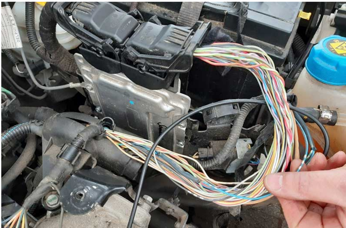
Figure 1: Check the wiring harness leading from the engine control unit to the ignition coil or to the injection valves