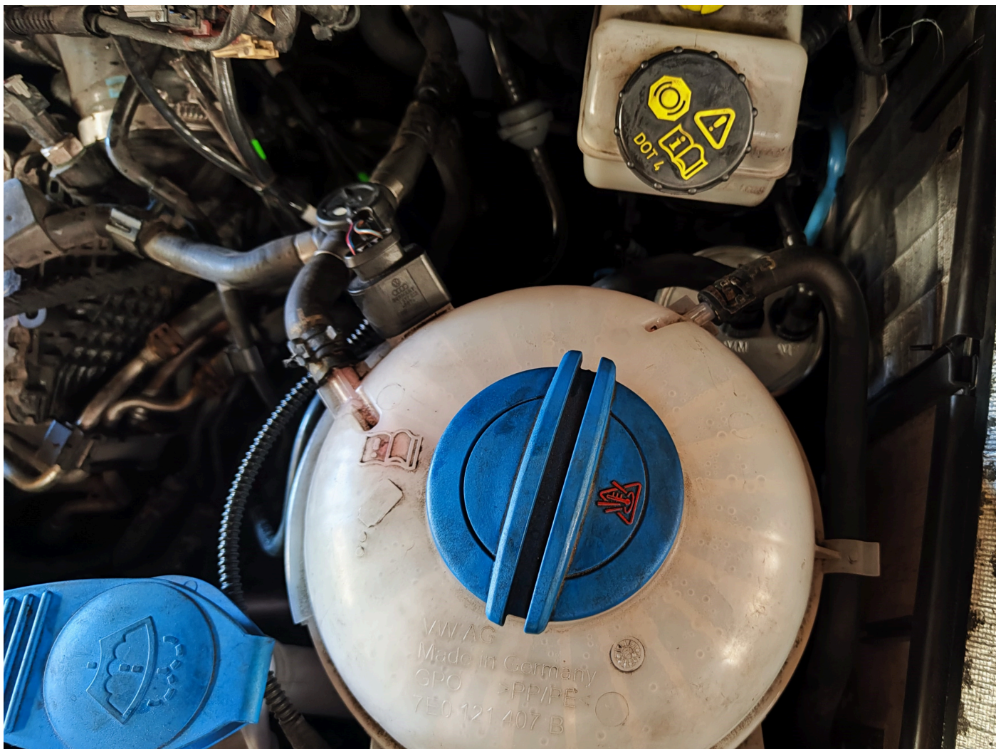
Expansion tank T6