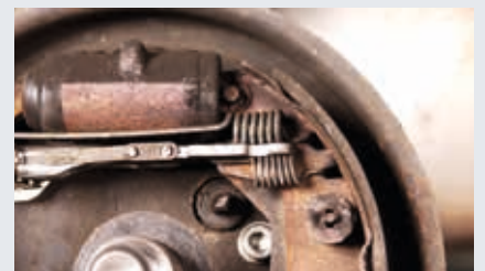
Old coil springs and brake shoes