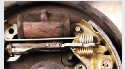
New coil springs and brake shoes

Worn coil springs in drum brake systems are a serious source of disturbance. Replacing them in good time ensures high spring tension, which is imperative for the brake to operate quietly and without vibration.