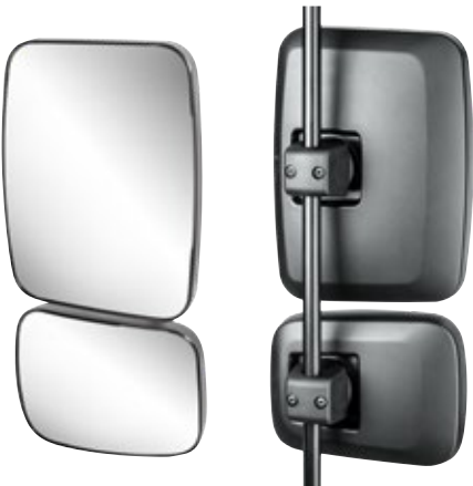
Combination example 8SB 501 550-001 and 8SB 015 039-081