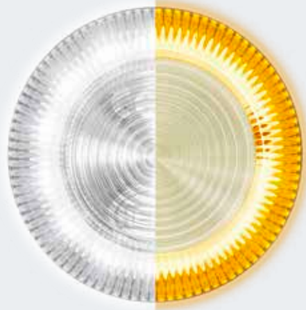
White working light