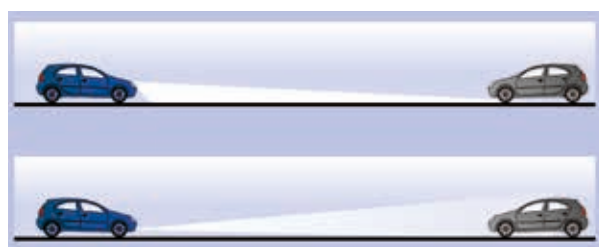
Fig.: System comparison of low-beam lights to daytime running lights

Min. = minimum distance Max. = maximum distance