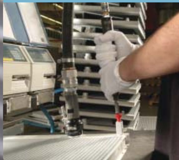
Air current flow measurement in the quality lab.