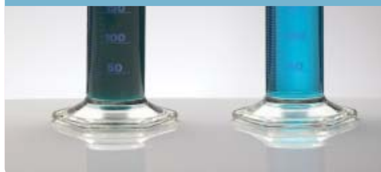
Consumed (left) and fresh (right) coolant.

This is general information. Vehicle and system-specific manufacturer details must be observed separately.