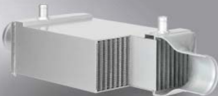
Indirect charge air cooler in section.

An engine cooling system can consist of various components. It is a sensitive system where all the components function together under heat and high pressure like a well-rehearsed team. All the modules are completely harmonised with each other for new passenger vehicles. Their level of performance and safety can be retained by using parts in original equipment quality. Technology competence, performance, accuracy of fit and material quality are in tune.