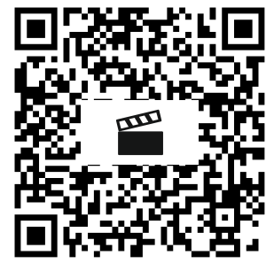
The Workshop's Friend: Find out more in this entertaining video.

For you as a workshop, HELLA will always point the way toward the right spare part. Thanks to HELLA's expertise when it comes to data management, spare parts can be swiftly identified – whichever product division they come from: electrics/electronics, thermal management, brakes or lighting. That's how we pilot you and all your repair work faster toward success!