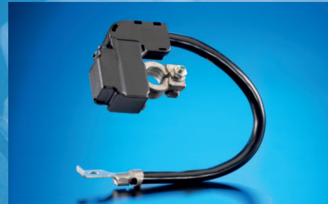
Intelligent Battery Sensor (IBS)