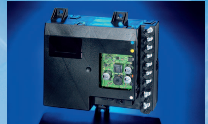
Charge converter from Hella in a vehicle electric control system unit