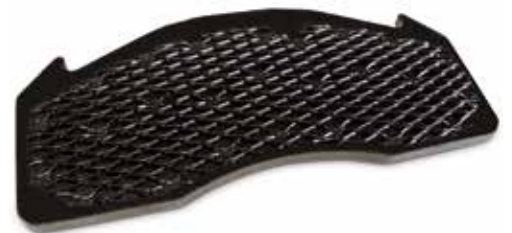
Steel plate with weld mesh

In addition, DON brake pads come complete with the required accessories where necessary. Not only do DON brake pads undergo rigorous tests as part of ECE R90 compliance, DON accessories are also fully tested and technically approved by TMD Friction and independent testing companies. These tests include a one million cycle endurance test for springs, vibration and shaker tests, as well as salt chamber tests.