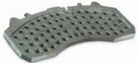
Cast iron backing plate