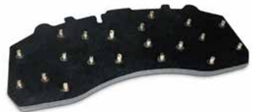
Backing plate with brass pins