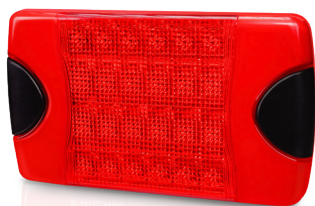
2SB 017 007-00X DuraLED®-S Stop/Rear Position Lamp with Night Light