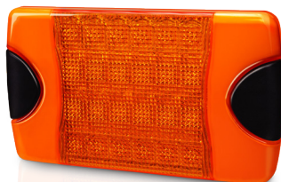
2BA 017 006-00X DuraLED®-S Rear Direction Indicator Lamp