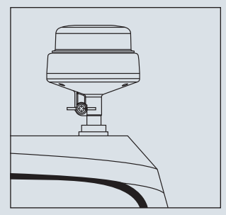
Bracket with thread