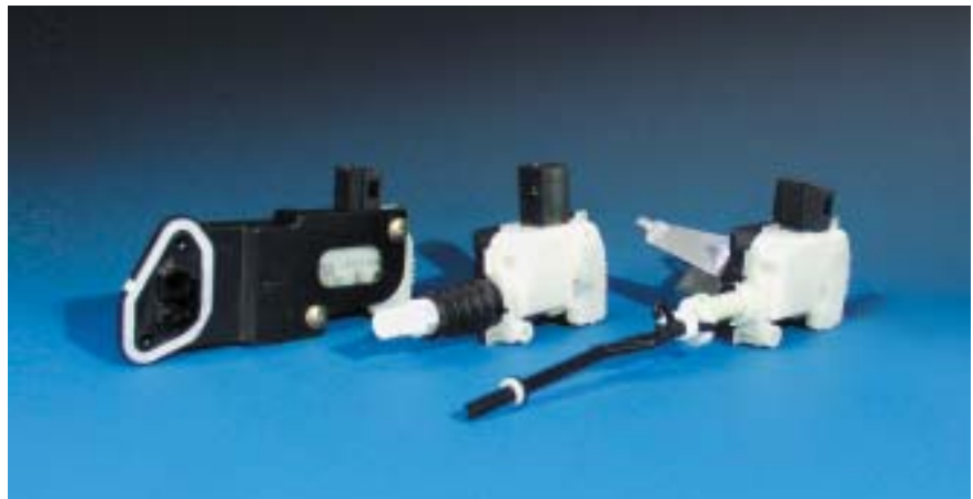
Different designs of Hella standard car-body actuators

Hella runs facilities for actuator development and production everywhere in the world and is currently in the process of establishing further international locations, particularly in the NAFTA and Asian regions.