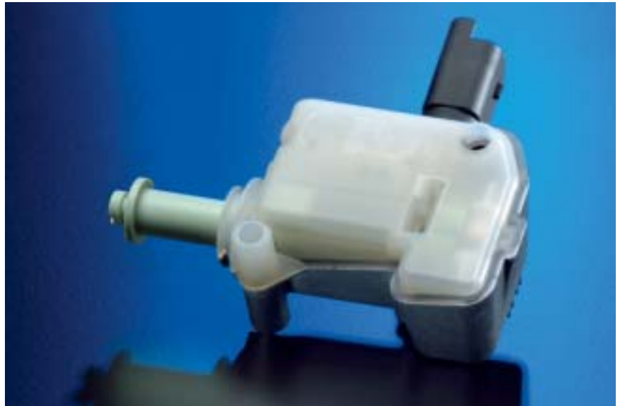
Latest generation standard car-body actuator with a filler-cap application

Actuators used in passenger-seat applications, for example, help to replace manually operated mechanical solutions, leaving more space for airbags or improving the convenience of operation. Folding headrests improve the rear view, thus enhancing the safety of pedestrians.