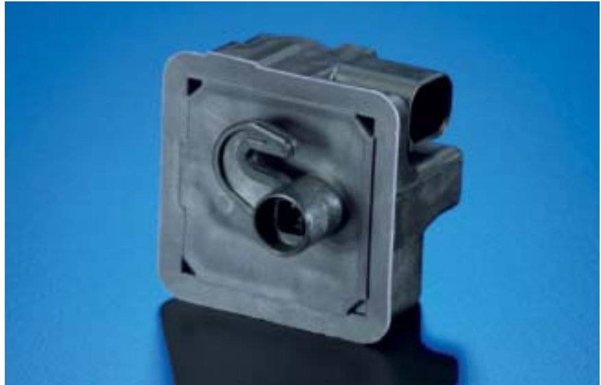
“Micro actuator” for integration into fuel-tank modules