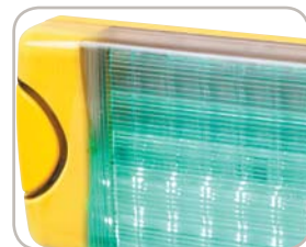
Green illuminated shown