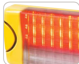
Red illuminated shown