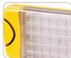
Optic appears clear until illuminated (off)

9.HMDLM001 Cover Kit, Yellow (Pack of 4)