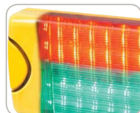
Red & Green illuminated shown