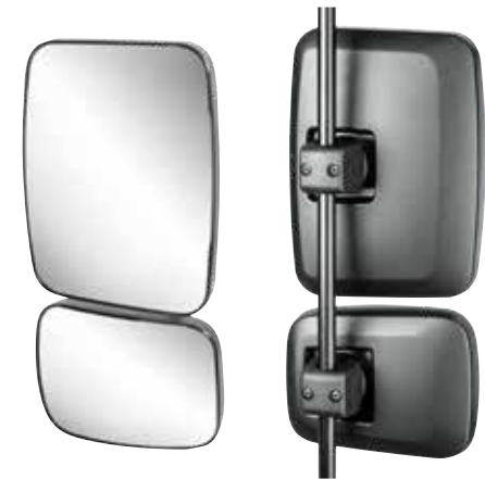
Combination example 8SB 501 550-001 and 8SB 015 039-081