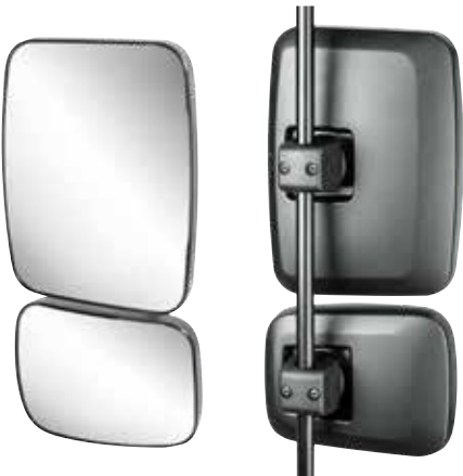
Combination example 8SB 501 550-001 and 8SB 015 039-081