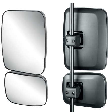
Combination example 8SB 501 550-001 and 8SB 015 039-081